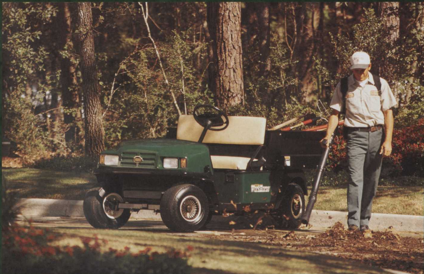
Above: Textron's E-Z-GO Workhorse has the ability to transport people, tools and equipment with relative ease around the course

Transporting materials, tools, people and powered equipment can absorb a lot of time during the day plus in some cases tying up the towing vehicle when it could be used for other jobs. As mowing equipment has increasingly become self-powered the