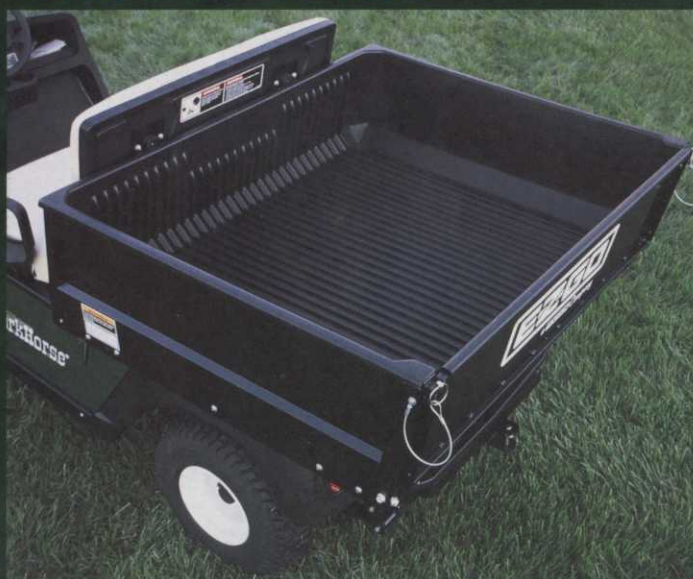
Below: The large loading boot area of Textron's E-Z-GO Workhorse

When considering one of these as a prime mover of materials the first item on the buying checklist should be - carrying capacity. Determine your specific requirements throughout the year and add a percentage for the unforeseen. This will provide a realistic figure from which to start looking at the choices available. There seems very little point in investing in a piece of equipment with a large carrying capacity that is not going to be fully utilised. Another point to take into account at this stage is the method of unloading. Does it have a tipping facility and is this manually or hydraulically operated?