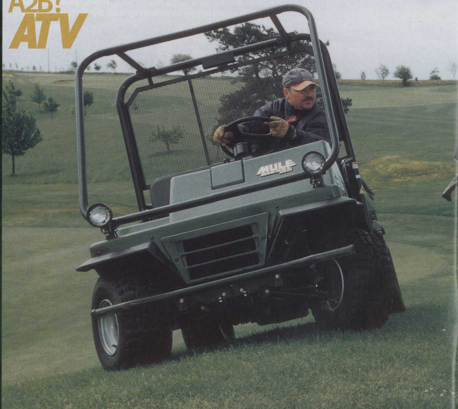
Above: The Mule 2510 combines a diesel powerplant with spacious practicality