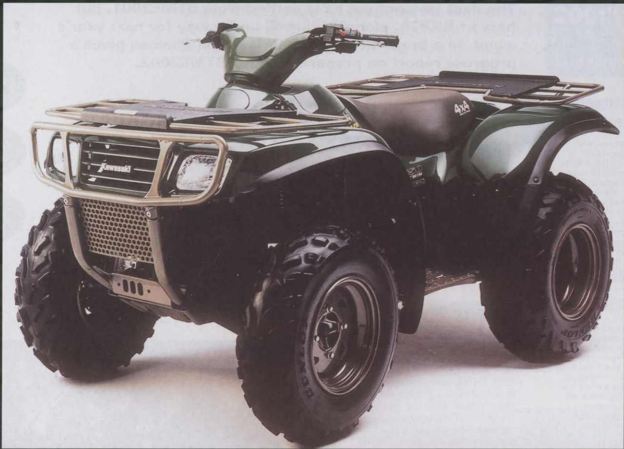
Left and above: Kawasaki's latest flagship model, the KVF650-A packs features not out of place in most modern saloon cars