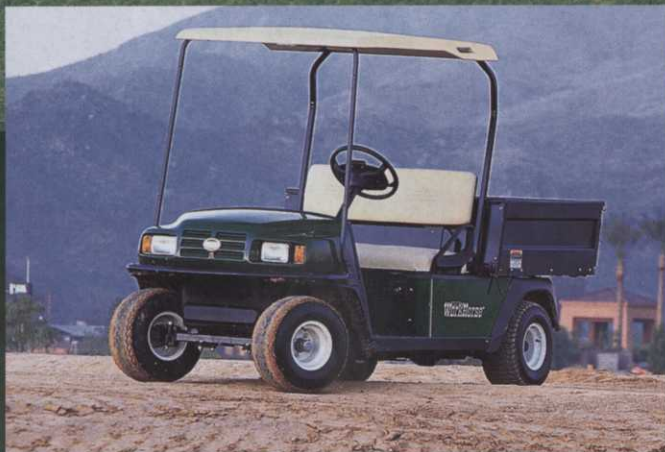
Above: Along with fairways, Textron's E-Z-GO Workhorse also handles loose terrain

types of vehicles often have to travel over user comfort is a point worth considering. Check out the following on the units you are considering; type of suspension, user friendly and safety features, plus the availability of optional cab and ROPS. Three-point linkage is either standard or an extra on many of the utility vehicles now on the UK market. The addition of this system or another towing facility enables a host of turf care attachments