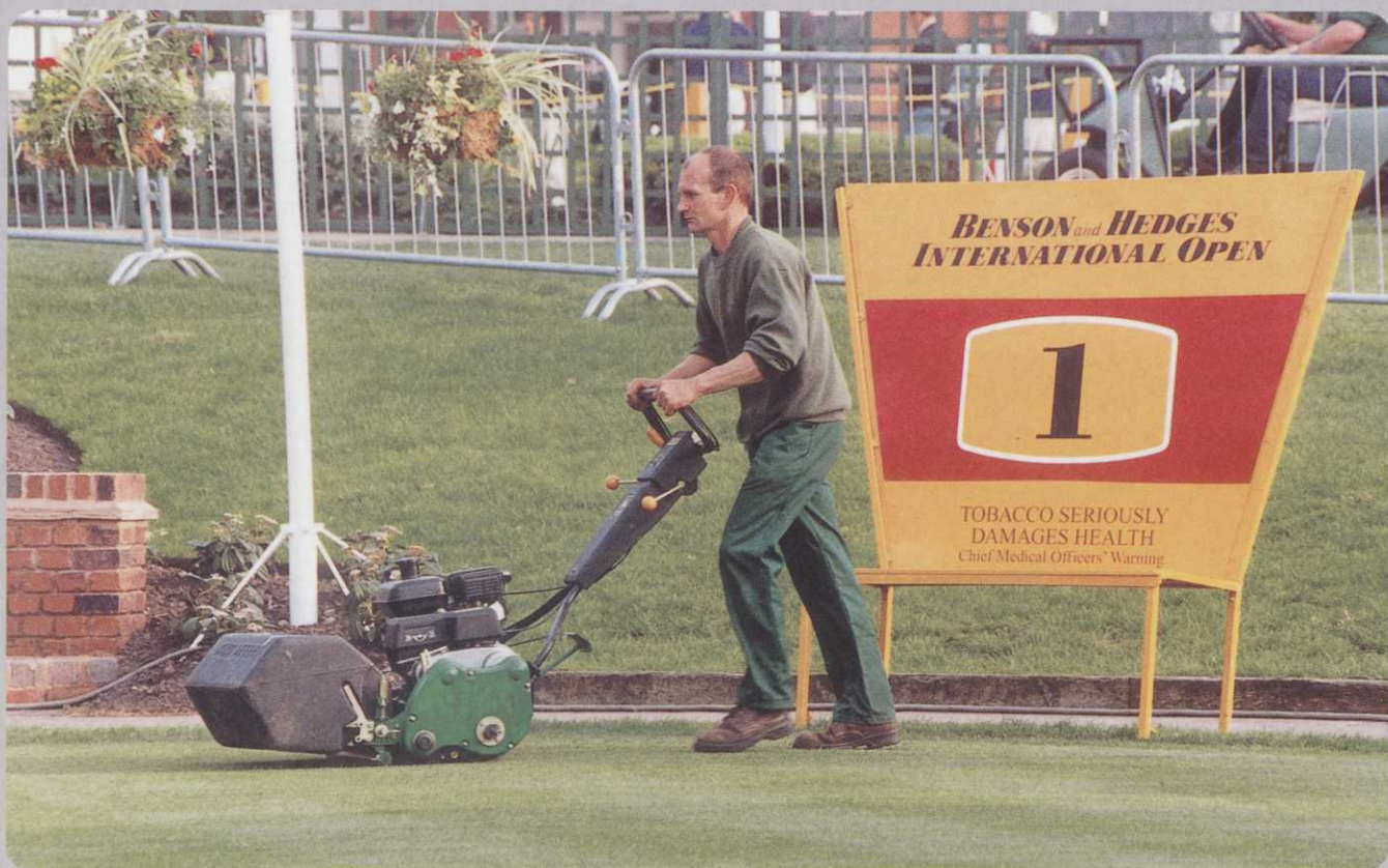
Above: Preparation work goes on during the Benson and Hedges International at the De Vere Belfry

The dictionary definition of a tee is - a cleared spot from which the ball is struck at the beginning of each hole. It is the words 'cleared spot' that sound a discord when it comes to modern greenkeeping. However, this statement becomes clearer when taken in the context of the history of the game. Originally there were no actual tees and the rules stated that the ball be struck