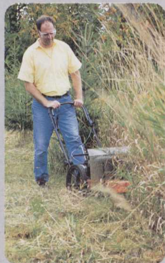
Give your tees a clean edge with a variety of products on offer