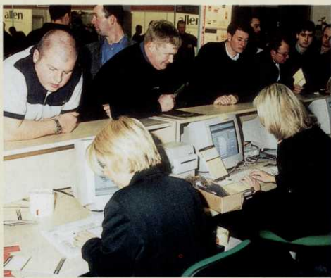
Above: The registration team was kept busier than ever before