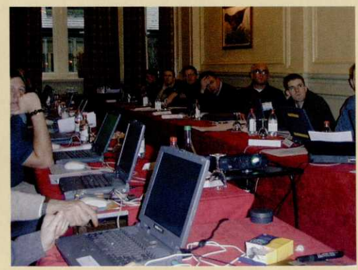
Above: Delegates get to grips with the latest technology in the computer workshop