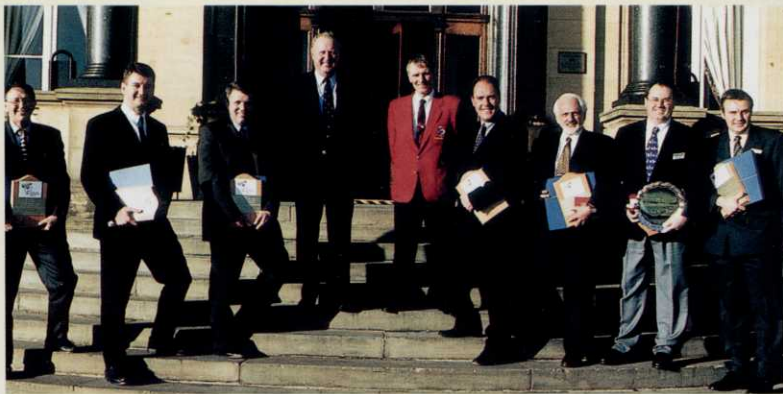
Left: Golden Key members with 10 years continuous support to the BIGGA Education and Development Fund receive a silver plate in recognition of their commitment to BIGGA's education and training initiatives.