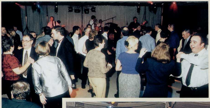
Above: Party goes getting into their groove