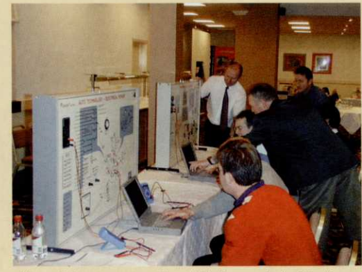
Above: Delegates get put through their paces in the Machinery Maintenance workshop