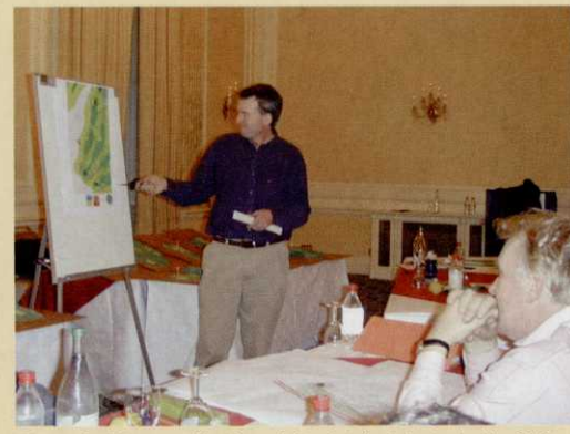
Above: A delegate talks through his finished design in the Golf Course Design 2 workshop