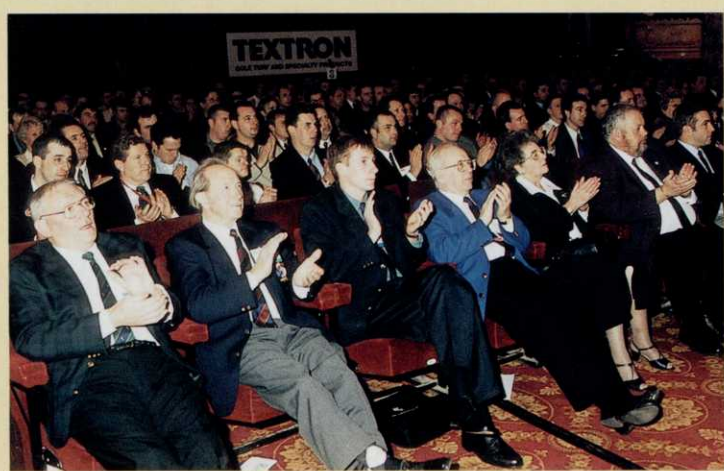
Above and right: A packed auditorium applauds Keynote speaker Richard Nobel as he recounts his motivational experiences behind his record-breaking landspeed attempt