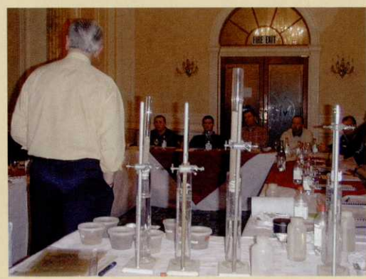
Above: The plants and soil science workshop in full swing