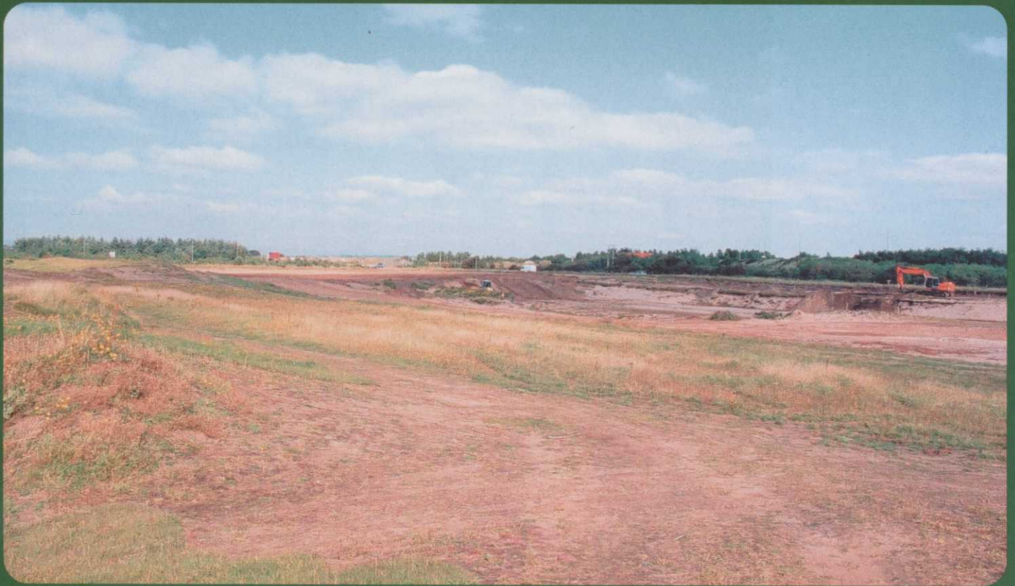
The rolling dunes are all man-made

The team stripped a 15 acre site on the edge of the course of rootzone and used some of this to build the two and a half metre high dunes which define much of the course's perimeter. Such is the quality of natural rootzone Southern Gailes has been able to sell some of it to off-set cost.