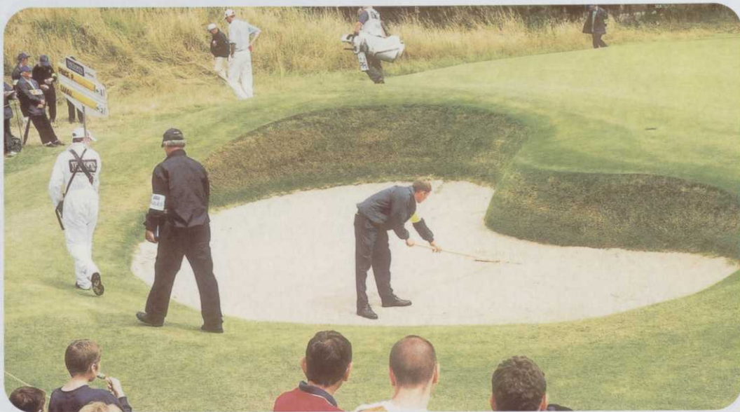
Above: An action shot from the third round