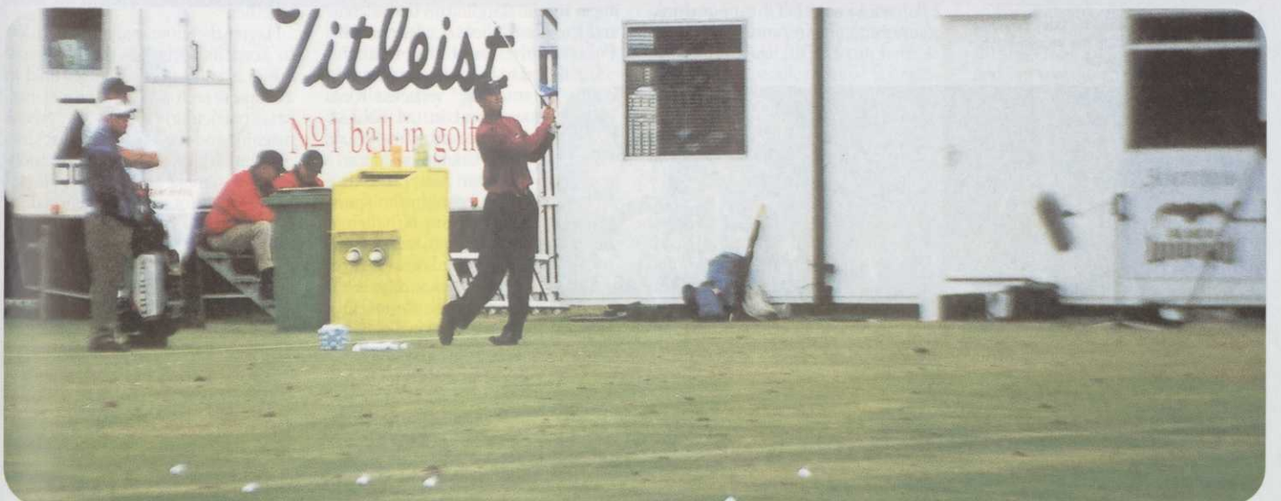
Below: The BIGGA marquee provided a magnificent view of the practice range and Tiger Woods trying to solve his swing problems