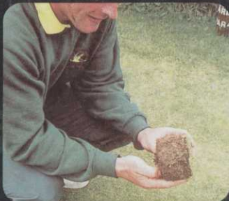
Below: A core taken from turf close to the shore shows good root depth