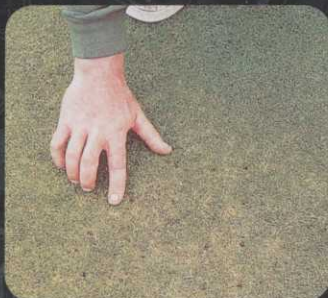
Above: They attempted to alleviate the dry patch by hand forking the greens