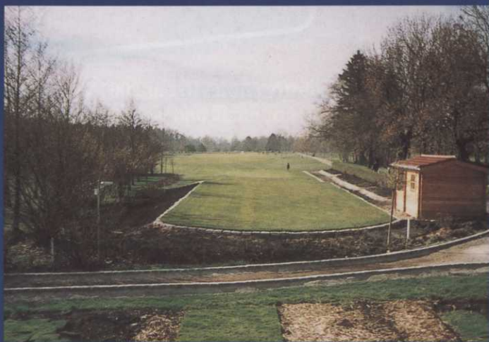
Below: The almost complete first tee, shortly before opening