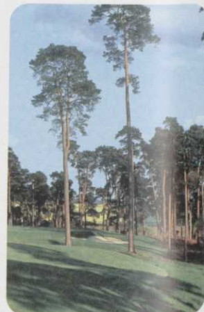
18 Woburn divides and conquers