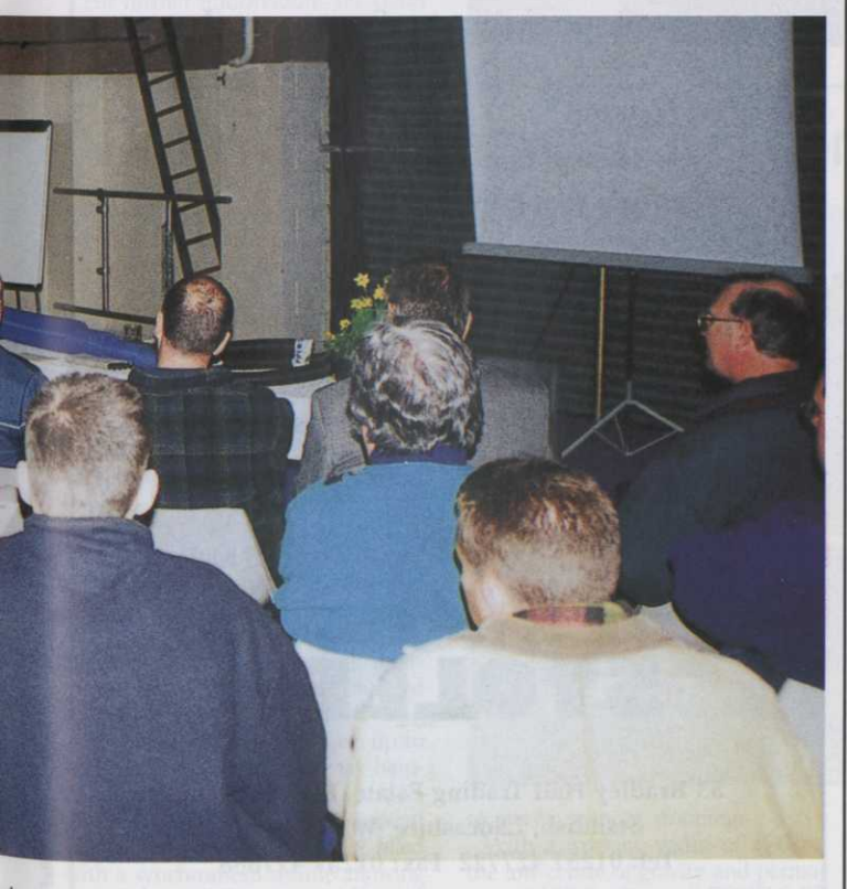
ducational experiences available to the visitor