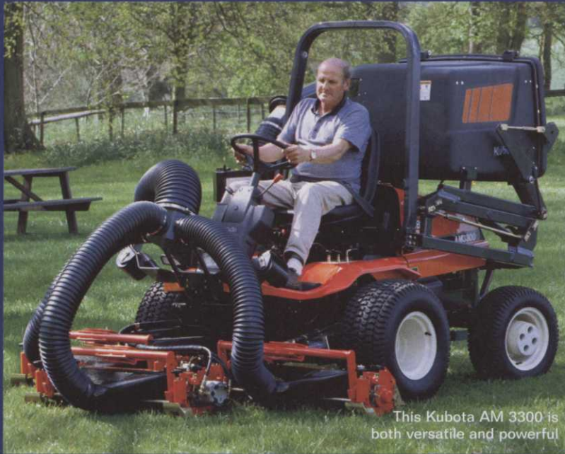
This Kubota AM 3300 is both versatile and powerful