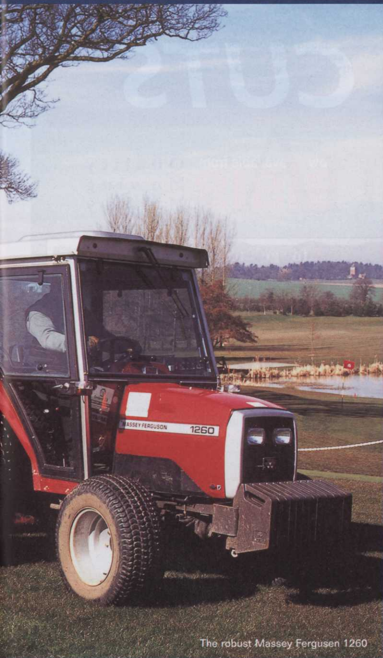
The robust Massey Ferguson 1260

There are three models in the Mistral compact series all are powered by green Yanmar diesel engines and have 12x12 synchromesh reverse shuttle transmissions. A 16x16 system with creep speed is an option.