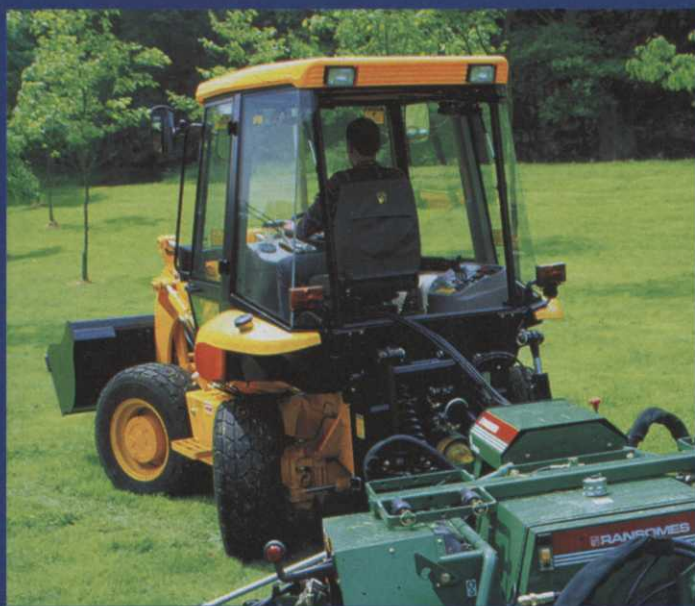
Above: The JCB 2cx can be adapted for many towing applications

The Japanese are credited by many with its introduction but it depends on what is classed as this type of tractor. If it is based on size and horsepower then a good candidate for the title could go to Harry Ferguson's TE 20. Some readers will remember the Wee Grey Fergie as it was and still is affectionately known. It was primarily used on farms, but a lot were sold to golf courses for pulling trailed gangs and the Hayter 6/14's which were used for cutting the rough.