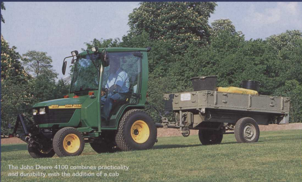
The John Deere 4100 combines practicality and durability with the addition of a cab