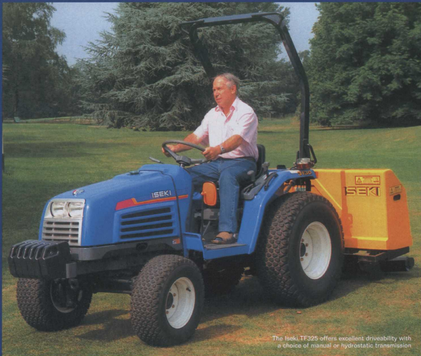
The Iseki TF325 offers excellent driveability with a choice of manual or hydrostatic transmission

in changing this situation and today, in light of the loss of agricultural business, manufacturers looking for sales are more inclined to direct their efforts in this sector. As far as golf is concerned, the question is how big is the demand for this type of tractor. Over the last two decades, turf maintenance equipment has changed considerably.