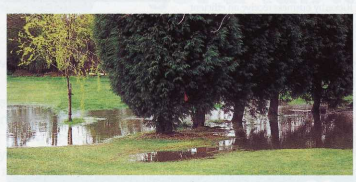
Humberston Park's flooding