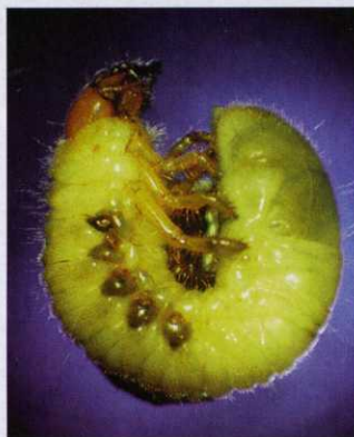
26 Effective Selection