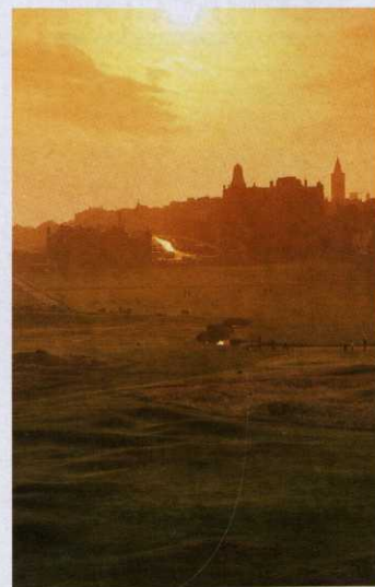
23 St Andrews prepares for action