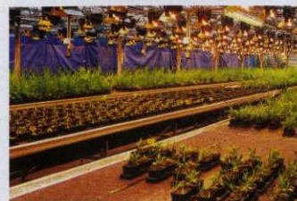
42 Dream Team