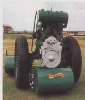
23 A Little Piece of History