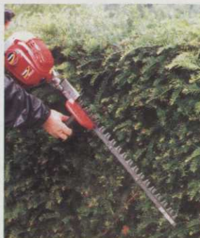
29 Awkward Jobs