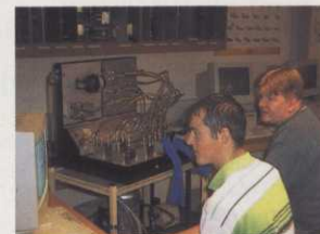
15 Learning Experience