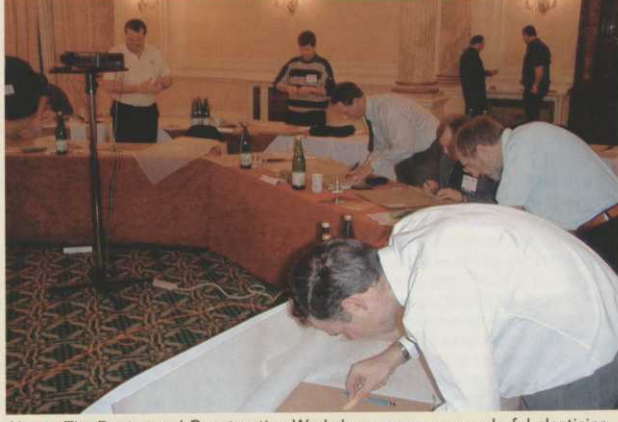
Above: The Design and Construction Workshop saw some wonderful plasticine models produced