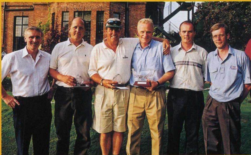
Above: The winning European Turf Technology team