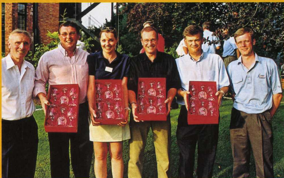
Above: The runners up. Spot the intruder