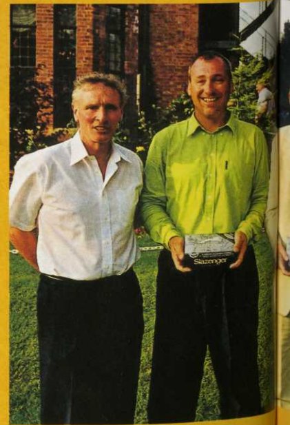
Above: It ain't 'alf hot mum!