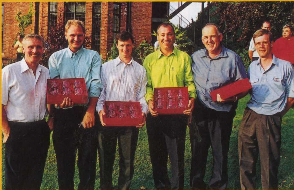
Above: European Turf Technology team 2 made it a successful day for ETT