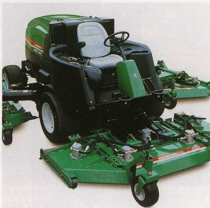
Above: The giant HR-9016 rotary mower for the municipal market, formerly a Jacobsen machine, now appears in the green livery of Ransomes

"We announced it to our work force at a recent employee meeting and they were positive although there is some sorrow that the Ransomes name will be lost to the golf market."