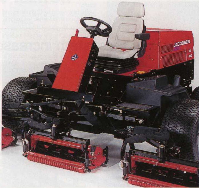
Below: The former Ransomes Fairway 305 now sports the distinctive orange Jacobsen livery as a dedicated golf mower