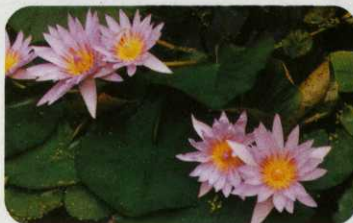
33 Add a splash of colour with a water feature