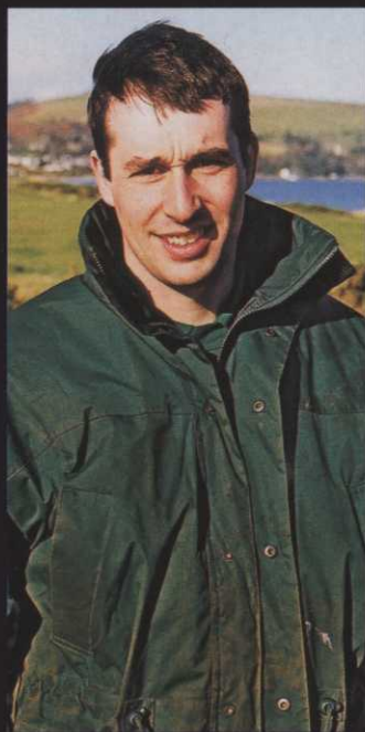
Above: Stuart Hogg