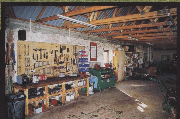
Right: Maintenance facilities