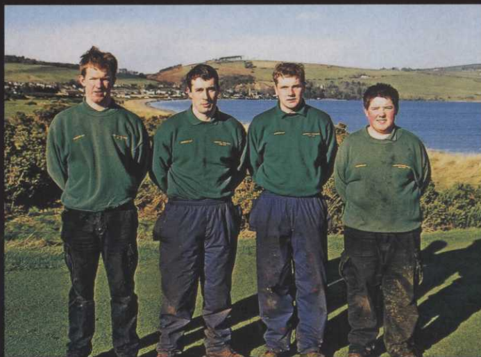
Below: The Fortrose & Rosemarkie team

the only club, to claim an entire peninsula as its own. The 18 holes, designed by James Braid, have been fitted into the 90 acres available and is about 600 yards at its widest point and 160 at its narrowest.