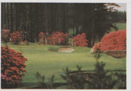
(23) Bearing a Hallmark: Slaley Hall