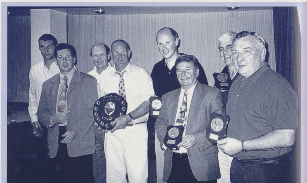
BIGGA's South East Northern Ireland Section enjoyed a superb day out and also raised £1,250 for the Heartbeat children's charity at the same time. The Greenkeepers' Charity Open attracted greenkeepers and visitors from as far afield as Sligo and it is hoped that the event will become an annual date on the calendar.