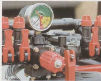
47 Spray it with Confidence