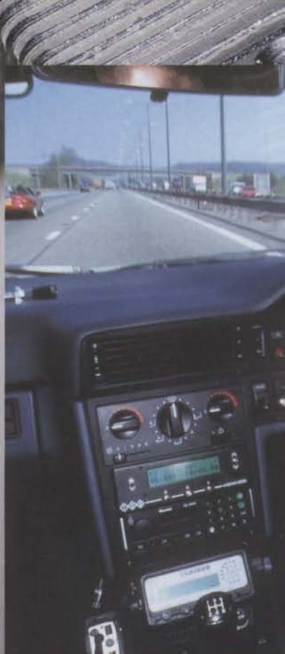
Above: A police tracker in action