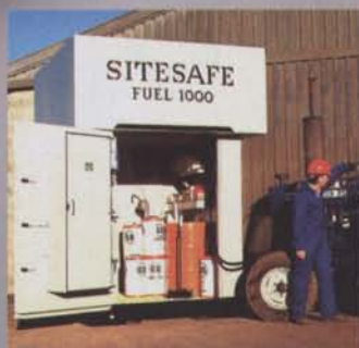
Below: Examples of secure storage solutions