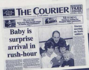
Above: Hold the front page!