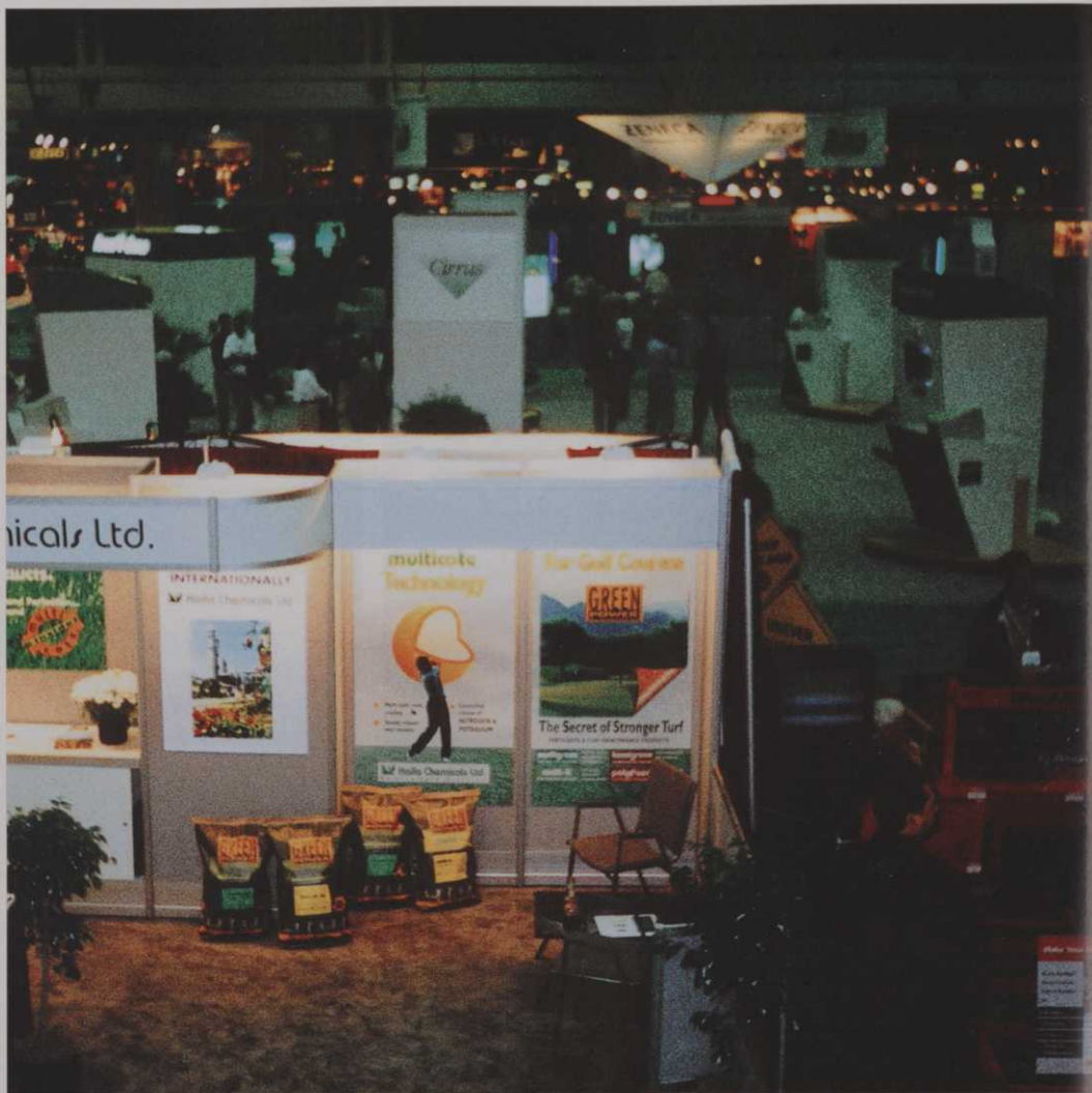
Above: Just one of the many GCSAA exhibition halls