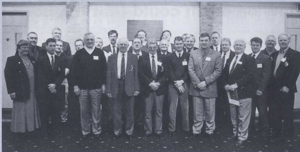
Section Secretaries from all over the country converged on BIGGA HOUSE for a two day briefing session on the workings of and developments within the Association. They were subjected to intense lectures on everything from the new BIGGA Stylo work wear, accounting, Greenkeeper International, the Charterhouse/Scotts BIGGA Golf Championship; membership and education as well as having the opportunity to get their own back by grilling staff on any matter they wished.