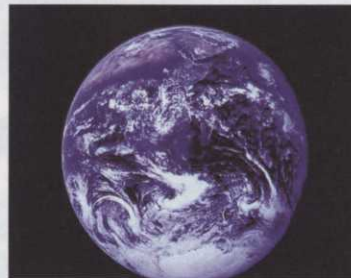
55 Saving Water