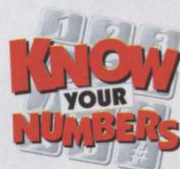
71 Win £50 with our Buyers' Guide quiz