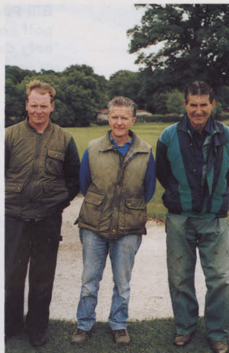
Below; This magnificent bridge was single-handedly built by Brian Ridgeway.

sometimes with the main drain on the low side with the others feeding in.