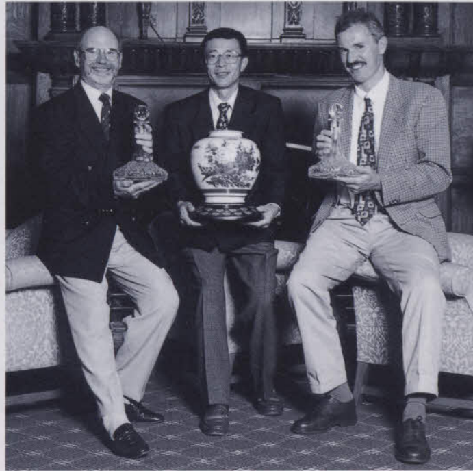
Lullingstone Park Golf Club receive their trophy

1998 is the first year of the Kubota Golf Club Challenge. Organised by Sporting Concepts, the event