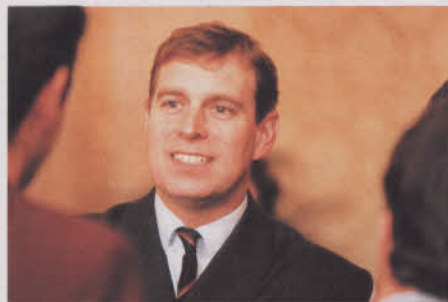
11 Open for business