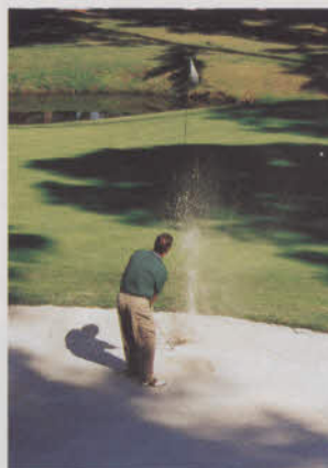
40 Sweet Georgia Greens