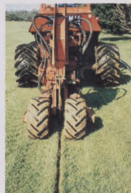
31 Can you dig it?