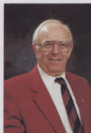
58 As I see it...