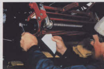
19 The Learning Experience: Nuts & Bolts