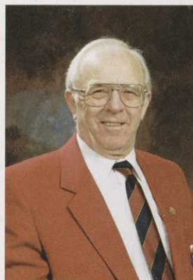
66 As I see it...