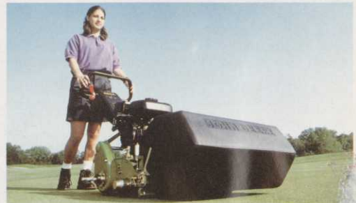
17 Would you scythe your green?