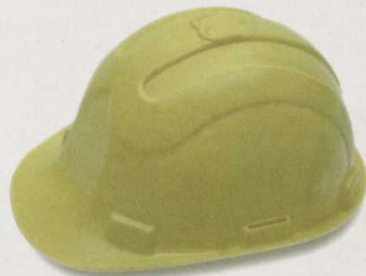
15 Health & Safety