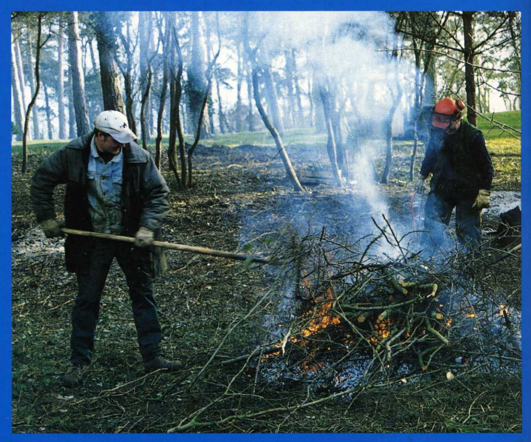
Above: Scrub clearance work continuing Below: Deputy

Toro GM Mower Set of B-Mows and Litamizer Massey Ferguson 4000 Series Tractor Husqvana Ride-On Rotary Mower