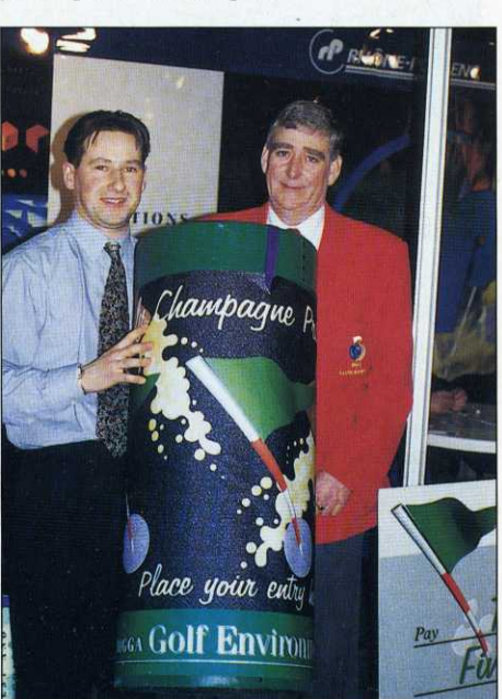
The Golf Environment competition: a big success GREENKEEPER INTERNATIONAL January 1998 17

The Open was one of several occasions Pat met up with Viscount Whitelaw