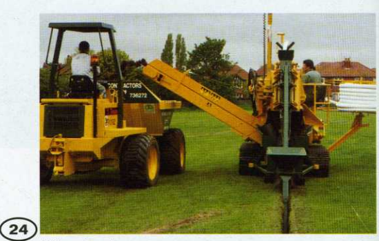
Wet, wet, wet