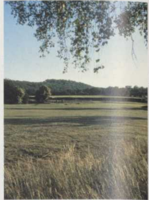
Lindrick, CC. Tel: 01162 520974