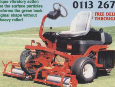
To fit Ransomes Greenplex 160, Toro, Jacobsen, John Deere, Lesco and Huxley