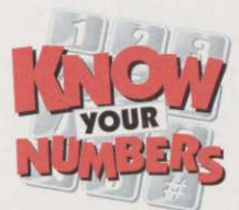
49 Win £50 with our new Buyers' Guide quiz