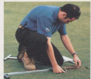
14 The Appliance of Science