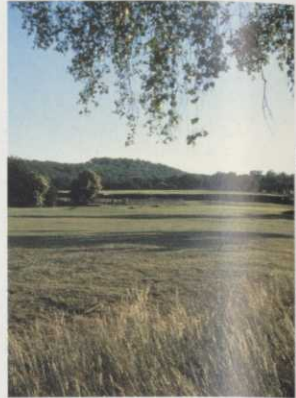
Lindrick, CC.