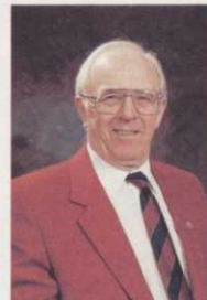
58 As I see it...