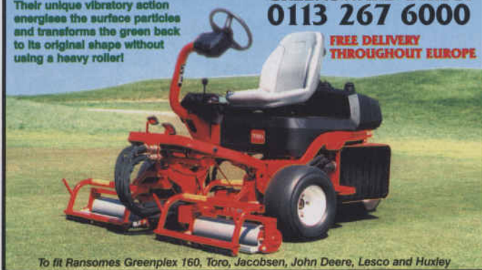
To fit Ransomes Greenplex 160, Toro, Jacobsen, John Deere, Lesco and Huxley