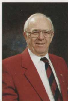
74 As I see it...