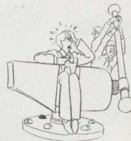
60 Money Matters