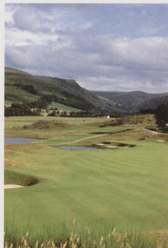
23 Cover feature: Gleneagles...