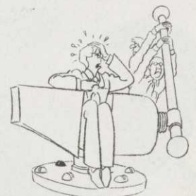
60 Money Matters