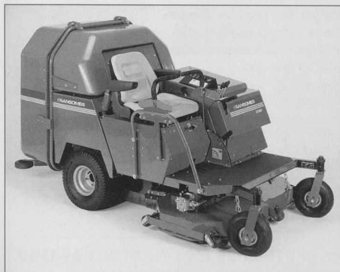
The Ransomes 45hp CT445, top and the Ransomes ZT323