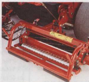
The new cutting system

An operator's dream, this new model is the latest in Toro's top-selling Greensmaster 3000 series. Its unique new cutting system gives a superb quality of cut.