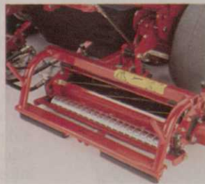
The new cutting system

An operator's dream, this new model is the latest in Toro's top-selling Greensmaster 3000 series. Its unique new cutting system gives a superb quality of cut.