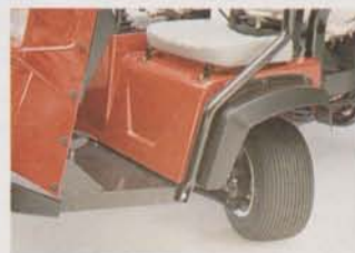
Two-wheel drive on full lock

Whatever time of year, this busy greenkeeper needs the right tools behind him to keep the golf course superb. With the Workman 3000 Series which boasts a large flexible carrying capacity, four-wheel stability yet three-wheel manoeuvrability, that's precisely what