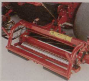
The new cutting system