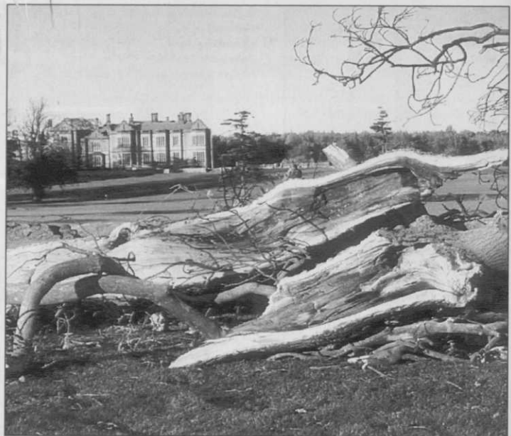
The recent high winds in the north east of England caused mayhem at Matfen Hall. Winds of over 90 miles per hour caused severe damage and one of the casualties was a oak tree which was over 200 years old on the 13th hole. Also the 4th and 7th holes were hit with large branches breaking off.