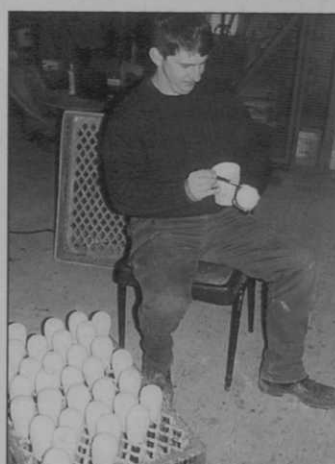
Not just a job for the winter. Tee markers will benefit from regular cleaning and a fresh coat of paint

Ensure that all on-course direction signs are clearly visible and