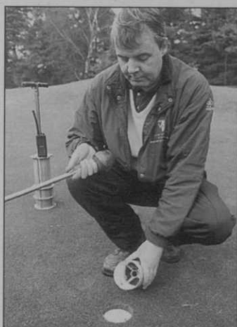
A freshly-painted or thoroughly cleaned pin cup will present an excellent impression to golfers as they putt

Are the entrances to the club and to the car parks clearly signed