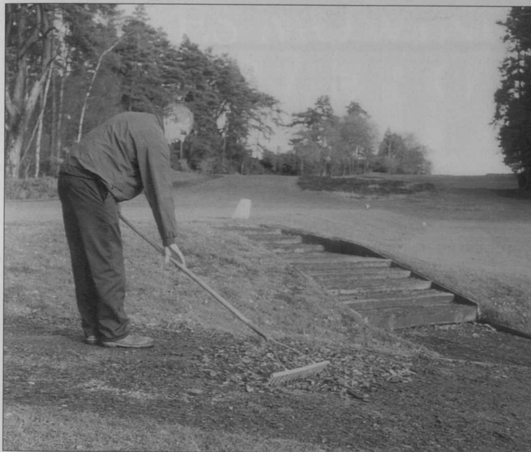
Replenish bare or thin patches on paths with fresh wood chips

way you want the traffic to flow and it will usually comply. Keep all signs clean and freshly painted. Similarly, ensure that hoops and posts are clearly visible and well maintained.