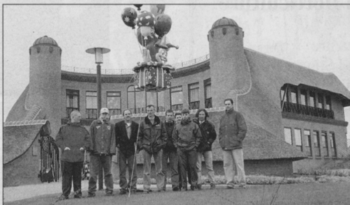
Students at the Efteling Golf Park at Kaatsheuvel