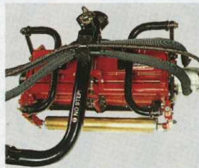
The new L-I-N-K-S™ system

Rugged, powerful and durable, they have the lightest of touches. Their new L-I-N-K-S™ system of floating linkage and individual lift arm dampers hug the turf to get into dips and hollows for a close, all-over cut with no "bobbing", even at speeds in excess of 7mph.