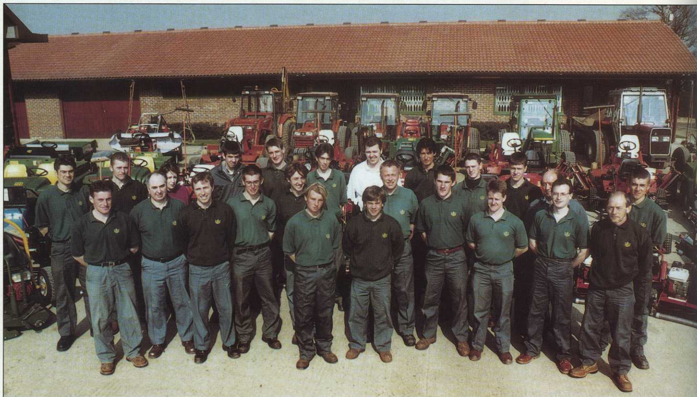
The team at the London Golf Club