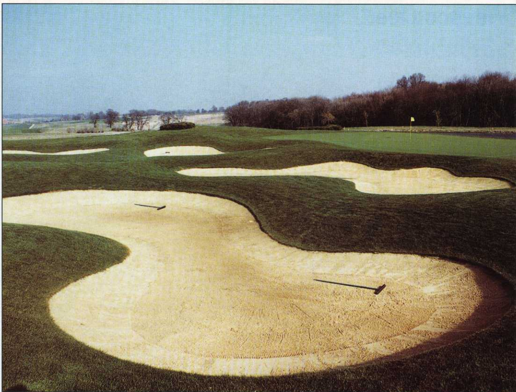
Neat touch: Rakes are left clockwise to the greens

The Heritage is sown with Providence creeping bent grass while the International is a Colonial bent fescue with 10% Providence – a Nicklaus trait designed