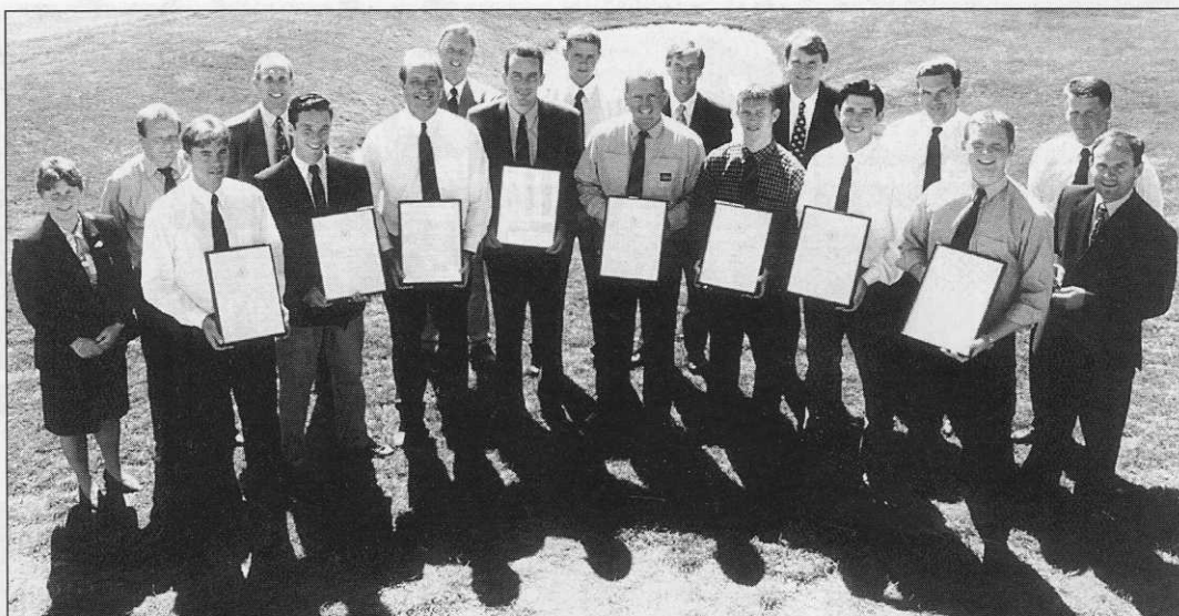
The award winning students with representatives of Gleneagles, Ransomes, Scottish Grass Machinery and the Greenkeepers Training Committee

Throughout the three day event, an exhibition is being staged. The exhibition is already fully subscribed with 31 stands taken up by contractors, irrigation companies, seedsmen, fertiliser and turf producers.